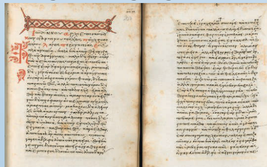
A copy of "On Fasting and Almsgiving" from a Patriarchal Homiliary (Munich, Bavarian State Library, Cod.graec. 255)

"Almsgiving is thus the wing of prayer. If you do not provide your prayer with wings, it will never fly. When, however, your soul sprouts wings, it flies immediately to heaven. How long will the love of money and the desire for possessions last? All those things, brother, last no longer than the present life." St. John Chrysostom's Homily on Fasting and Almsgiving