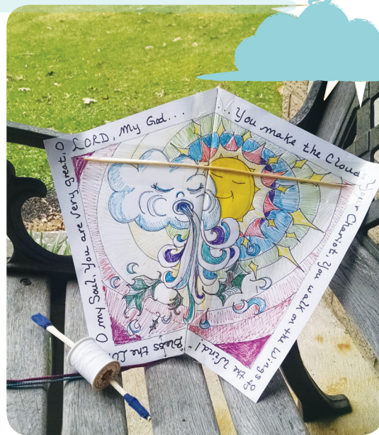
Let's make a kite! ARTWORK BY LYNNE WARDACH (C) 2019