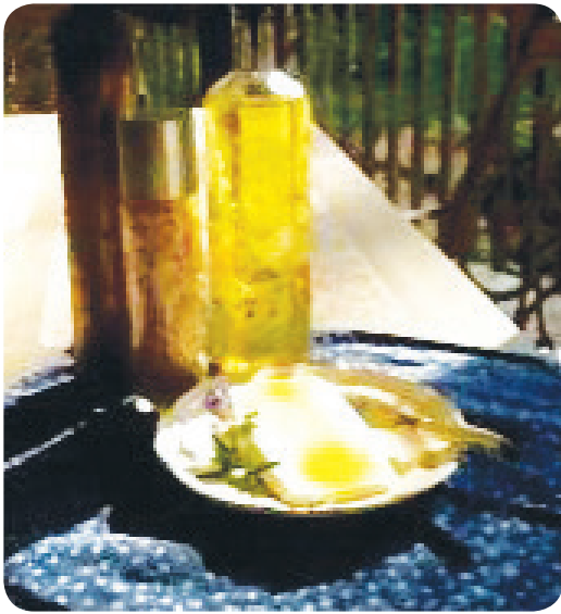
St. Mamas Cheese