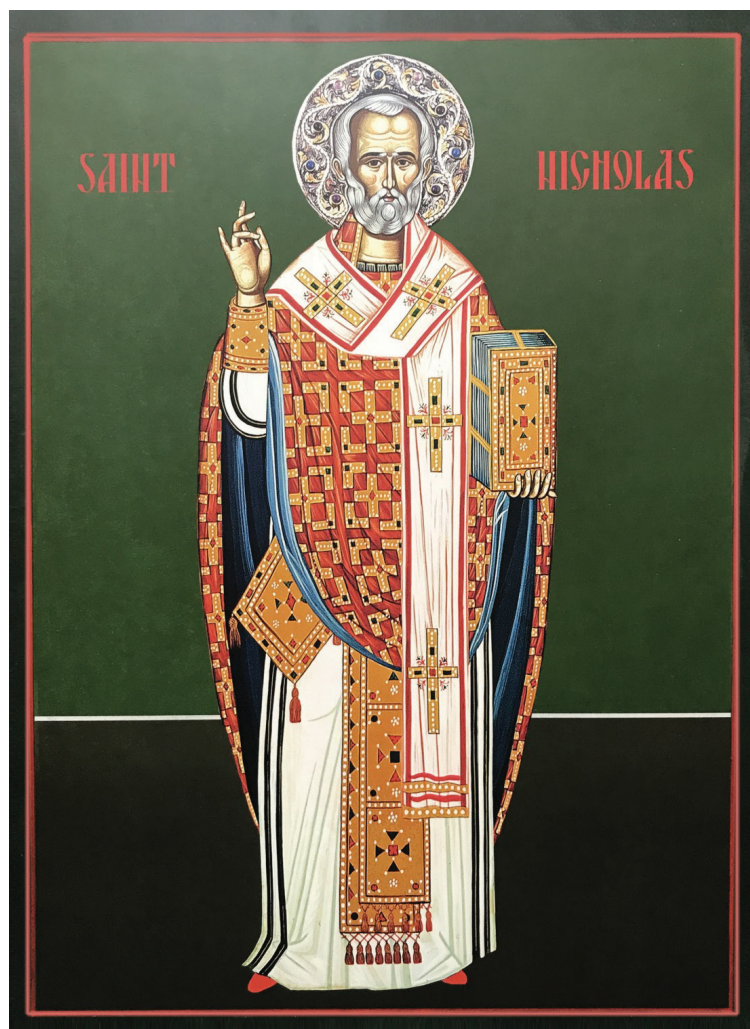
ICON OF ST. NICHOLAS AT SS JOACHIM AND ANNA UKRANIAN CATHOLIC CHURCH, FRONT ROYAL, VA

Nicholas was later chosen to be Archbishop of a city called Myra. He was a merciful and wise leader, full of zeal for the Christian Faith. At one point, he was imprisoned by the emperor for his strong faith in Christ, but even that didn't stop him from teaching people about God! Even during his life, people considered him a saint, and he was known for working miracles, which is why we call him a "Wonderworker." Saint Nicholas died around the year 337 AD. Today, we especially remember Saint Nicholas as an example to us of charity, generosity, wisdom, and zeal.